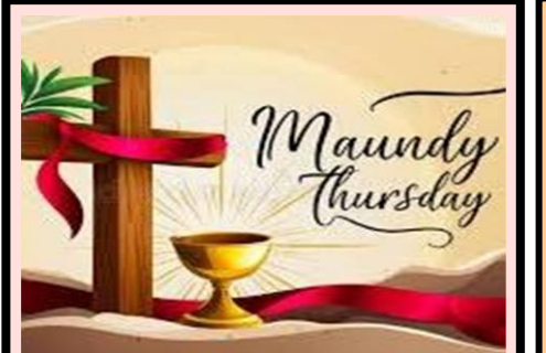
Service This Thursday, the 17<sup>th</sup> 6:00 pm

Good Friday, April 18 at 12 noon Deville & Nevers Street Market Common